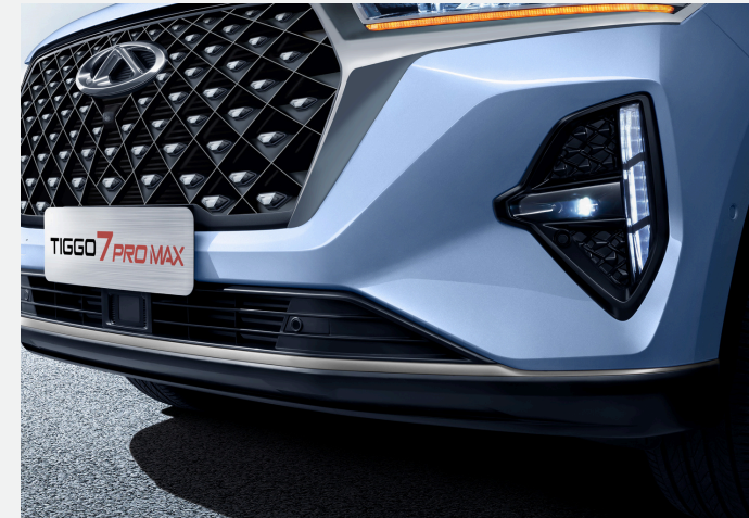
• 'Sunshine Galaxy' Grille