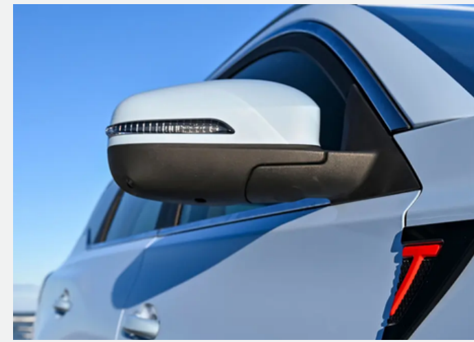
• Electronically Controllable Exterior Mirrors